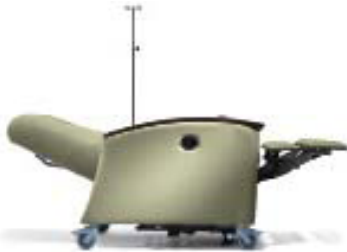
4-sided Brake Access

During the path of Progressive Mobility , the Symmetry Plus Treatment Recliner promotes patient recovery. With an infinite number of recline positions and extended arm caps for safer ingress and egress, the recliner is a safe and comfortable platform for patient use.